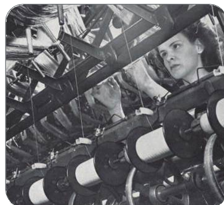
Cowansville and Bruck Mills: a textile vein Permanent exhibition

Jean-François Renaud's exhibition deals with the encounter between the textile medium and various contemporary processes in digital creation, exploiting the approaches of generative art and generative AI. The artist takes a fresh look at textile art and the material itself, magnifying the material's properties through both images and real weavings.