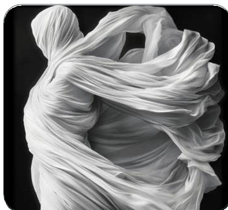
Textiles and generative art by Jean-François Renaud Medium: experiments transposed onto textiles July 10 to September 13 Vernissage Saturday, July 12 at 2 p.m.

In a symbiosis of form and content, Léa Mercante uses light as her raw material. Using fragile, trans-parent or colored materials such as fishing line, fabric and ribbon, she creates abstract forms that become a kind of imprint of light. From thread to light and from light to thread, she weaves shapes that emerge from her canvases like trompe-l'œil.