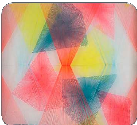
Entre lumière et matière by Léa Mercante Medium: textile art Until July 5

From June 24, Wednesday to Sunday, 10 am to 4 pm.